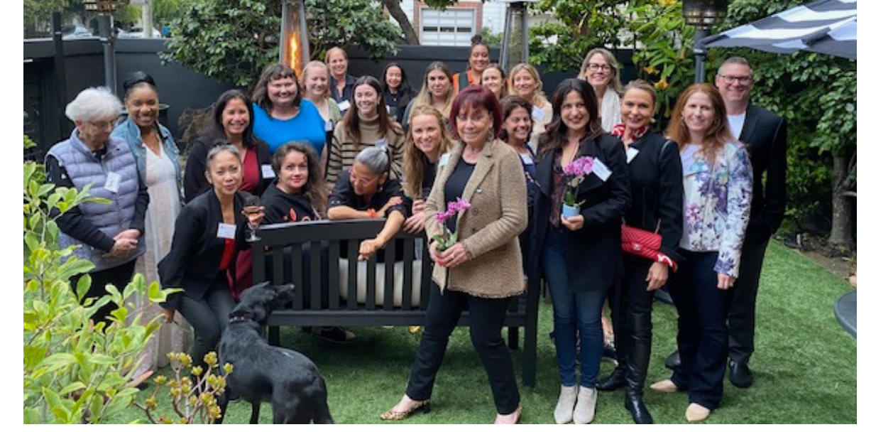
2023 San Francisco Volunteer Appreciation